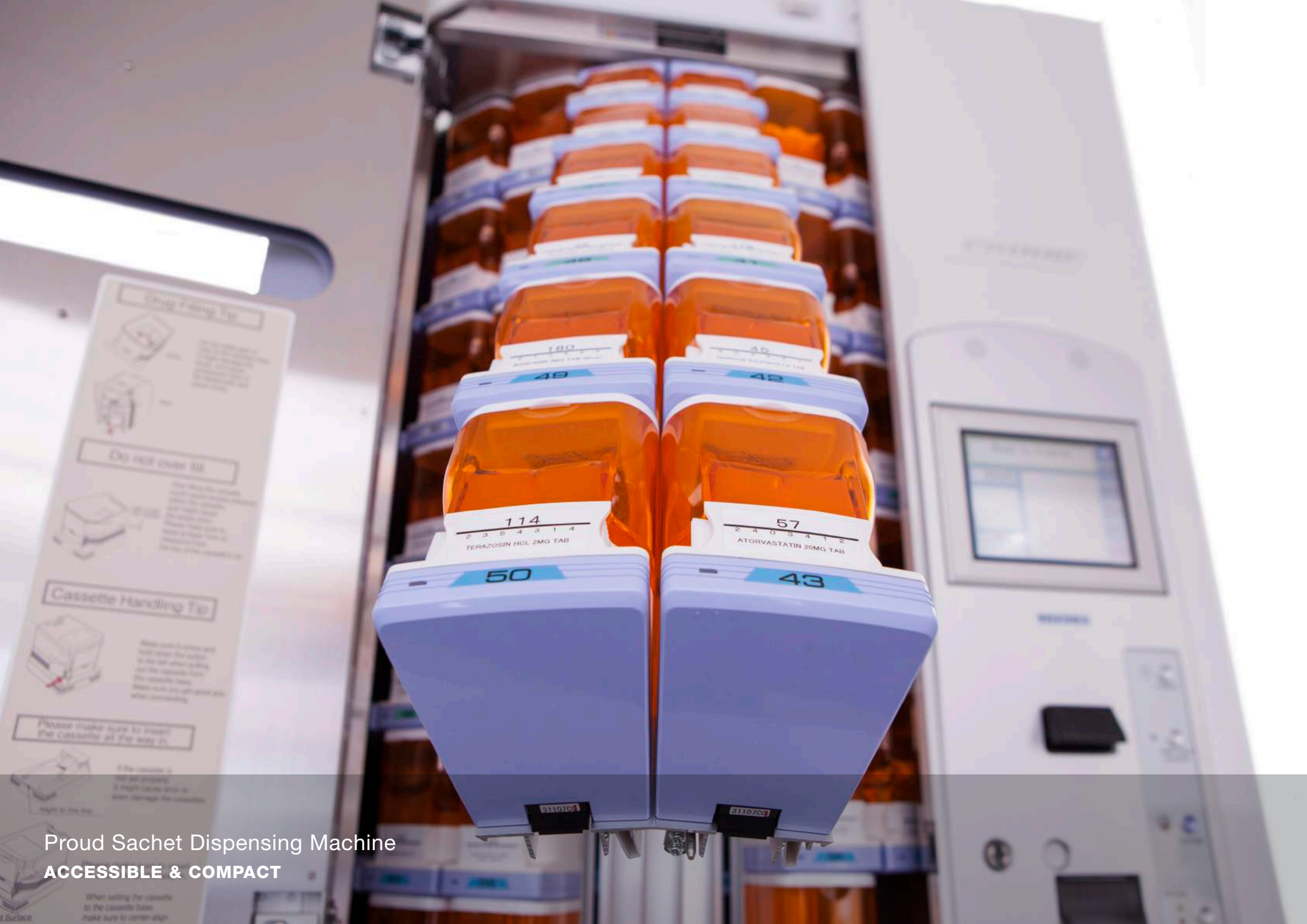
Proud Sachet Dispensing Machine ACCESSIBLE & COMPACT

Drug Filling Tip Do not cover the Cassette Handling Tip Please make sure to insert the cassette all the way in.