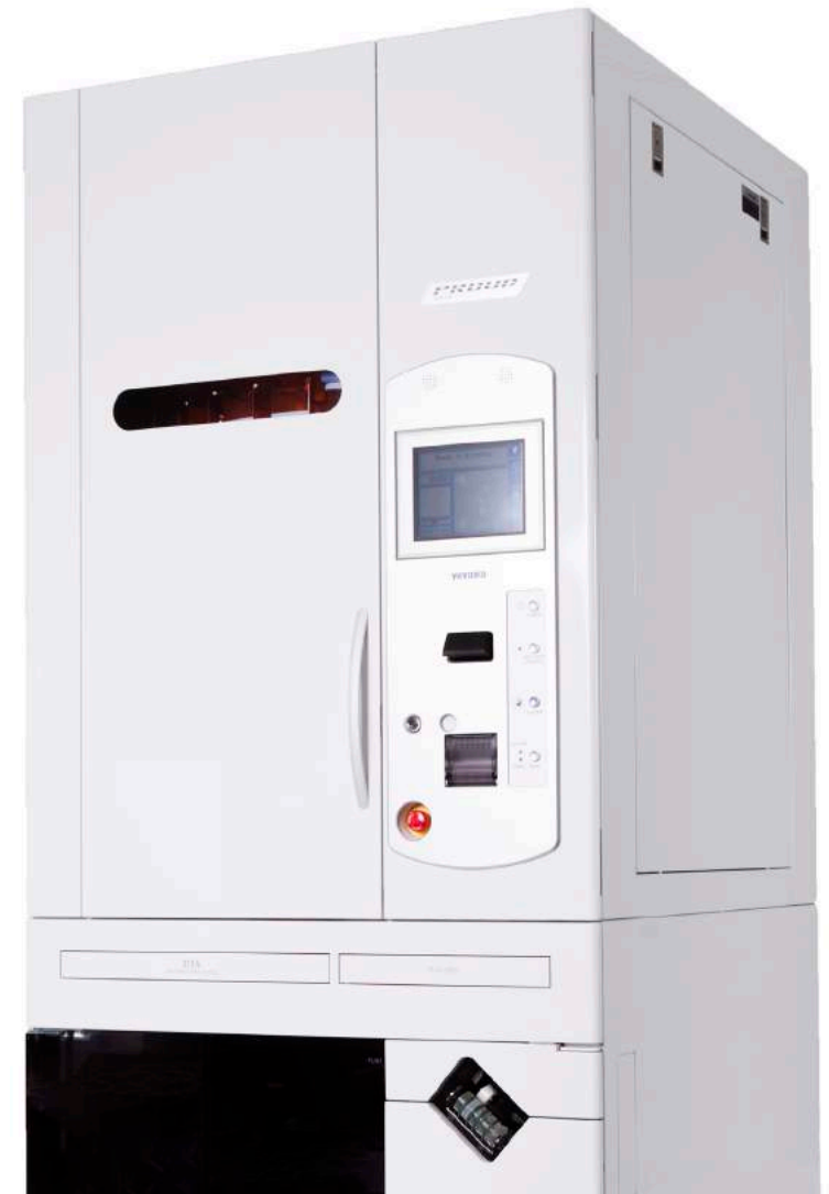
Proud Sachet Dispensing Machine PRODUCT OVERVIEW

The Proud's advanced features and benefits, deliver to your pharmacy one of the world's most advanced dispensing robots.