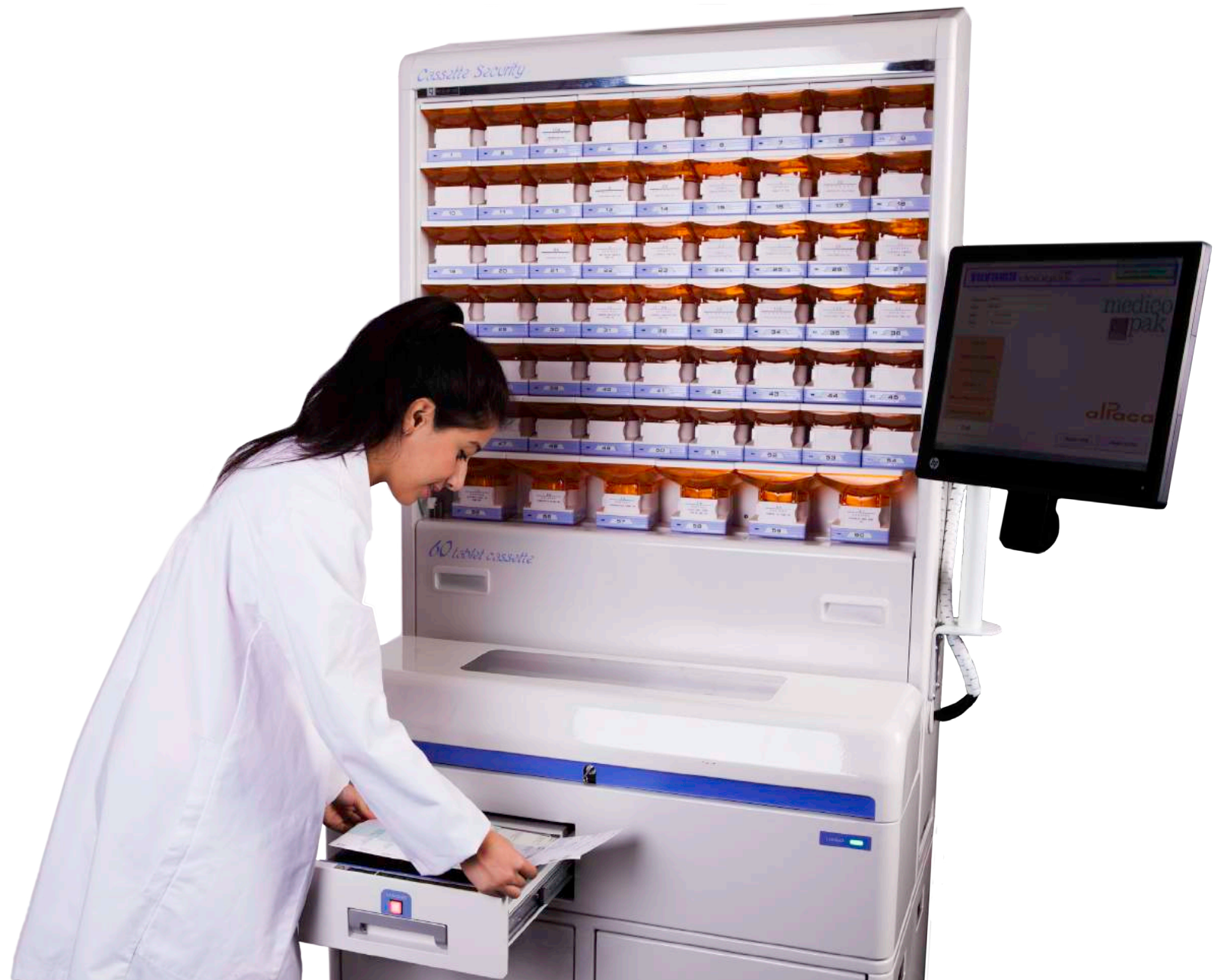
Alpacacassette Blister Pack Dispensing Machine INNOVATIVE DISPENSING SOLUTIONS