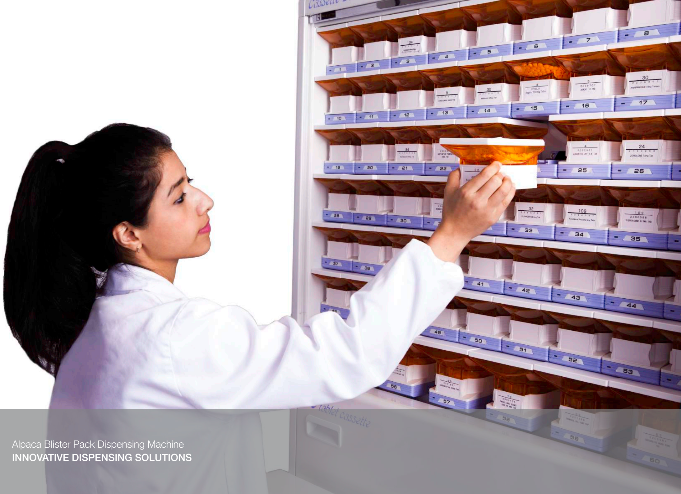
Alpaca Blister Pack Dispensing Machine INNOVATIVE DISPENSING SOLUTIONS