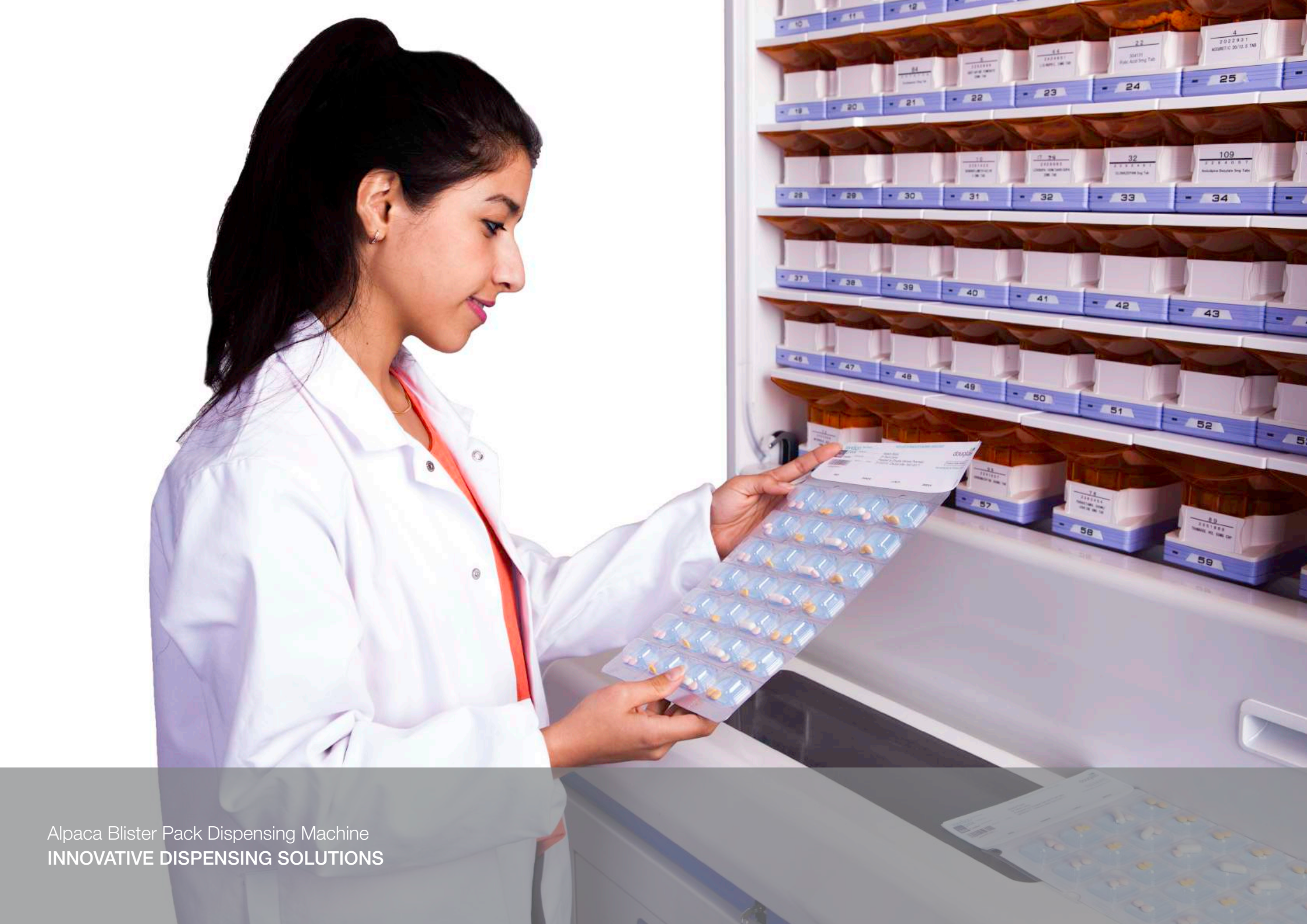
Alpaca Blister Pack Dispensing Machine INNOVATIVE DISPENSING SOLUTIONS